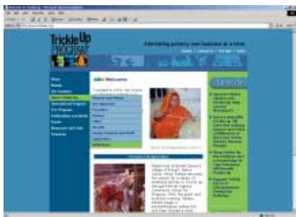
Figure 1 Trickle Up Website www.trickleup.org

While Trickle Up's focus has been on integrating people with disabilities, the GDDI conference highlighted the need for special attention for women with disabilities, who face even more barriers to inclusion as men. Given Trickle Up's interest in increasing outreach to women in its program delivery, the combination of the two goals seems an important focus, to ensure we reach both targets of the inclusion of more women and more people with disabilities in our entrepreneur population.