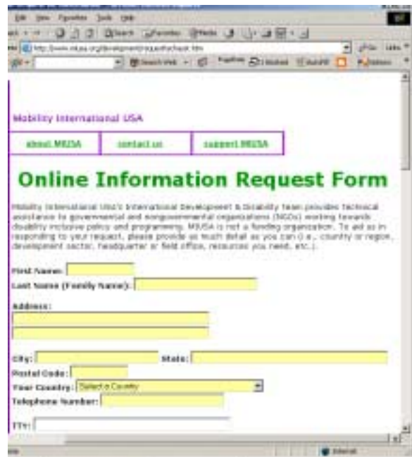
Figure 2 New online request form at www.miusa.org

Visit www.miusa.org/development to see exciting new changes on our website. Use our NEW Online Information Request form to ask us for technical assistance and resources. Or, search our online database of Disability Organizations Worldwide to identify organizations in regions and countries where you are working.