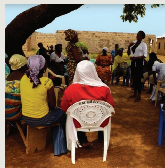
A WILD alumna in Ghana training women with disabilities at the grassroots level.

SCALING UP » Reaching the 500 million women and girls with disabilities worldwide!