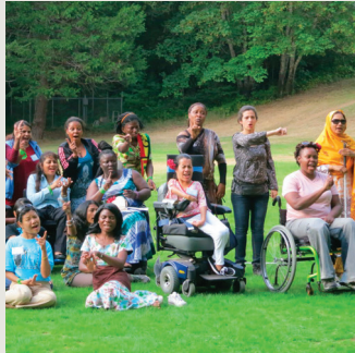
WILD program in Eugene, Oregon